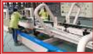
Folder gluer machinery