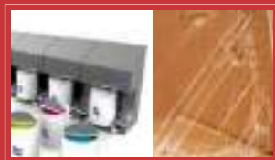
Inks & Adhesives