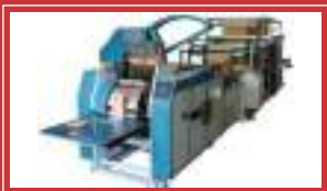
Paper Bag Making Machine