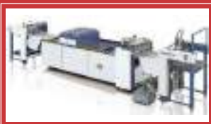
Carton making equipment